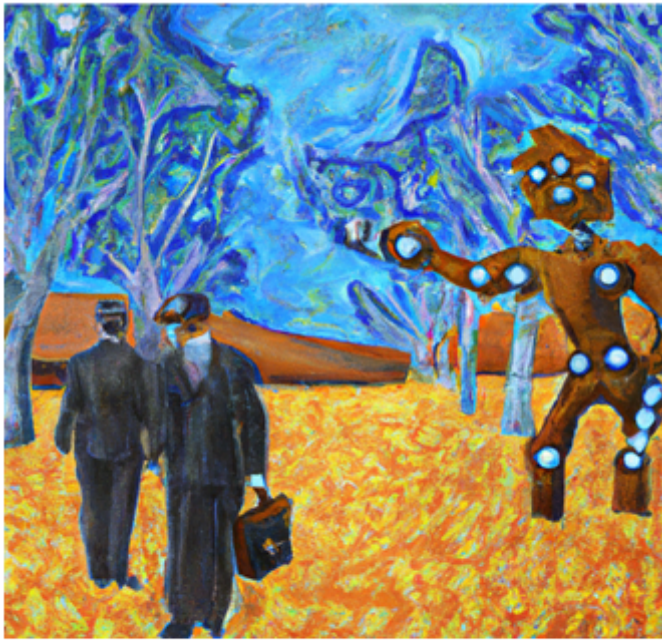
This image used was generated by Dall-E, an AI system that can create realistic images and art from a description in natural language. We asked it to produce a picture of bankers in the future, in the style of Van Gogh.